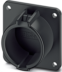
CHARX connect, Charging connector holder, for vehicle charging connectors on charging stations (EVSE), Type 1, SAE J1772, Front mounting

Please be informed that the data shown in this PDF Document is generated from our Online Catalog. Please find the complete data in the user's documentation. Our General Terms of Use for Downloads are valid ( http://phoenixcontact.com/download )